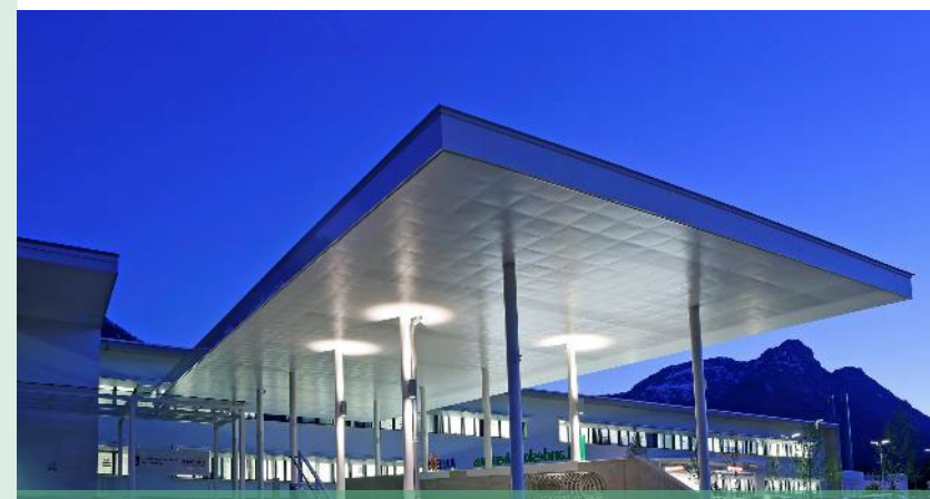
Standort Bad Aussee