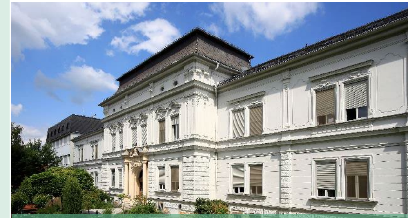
Standort Bad Radkersburg