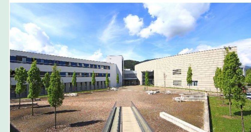
Standort Bruck a.d. Mur