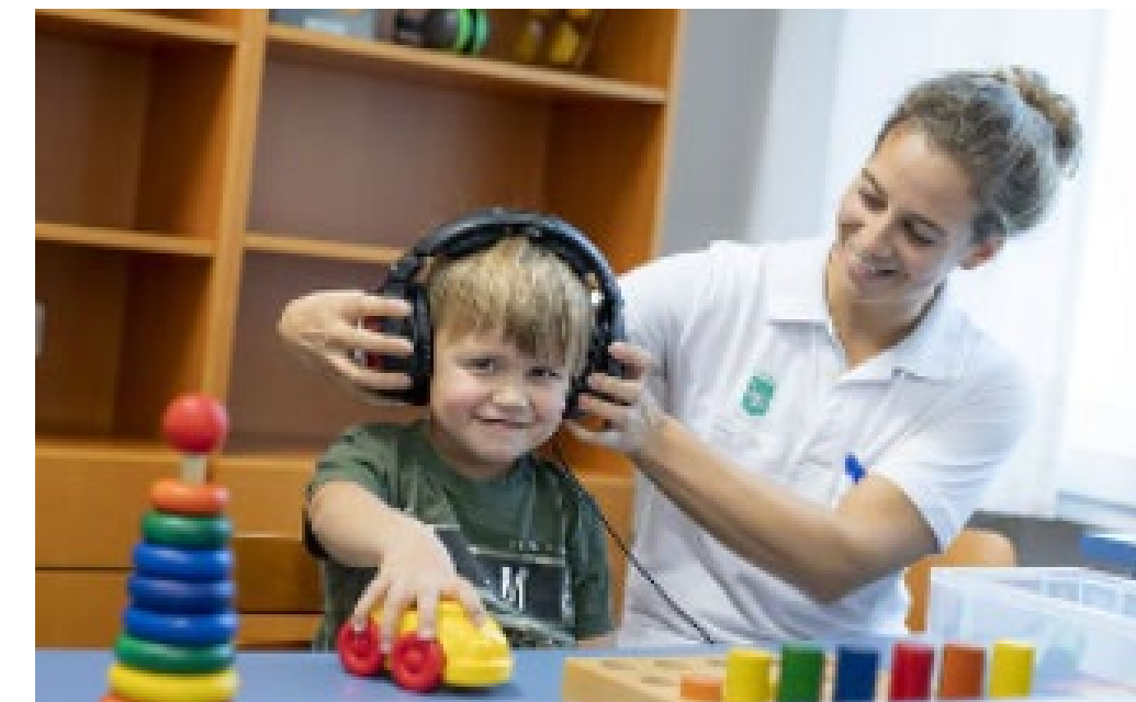
1,700 medical-technical staff