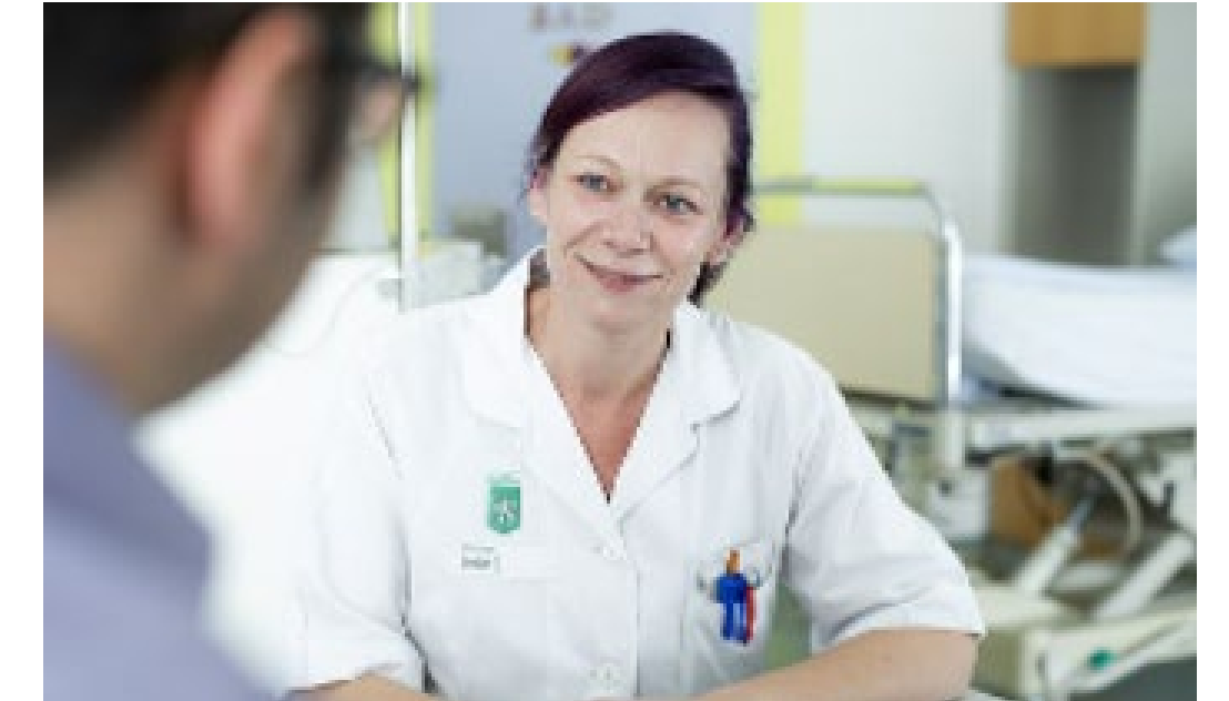
8,700 care staff (DGKP, PFA, PA)