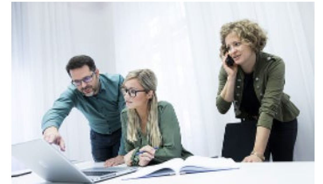
5,300 staff in administration, business management, engineering