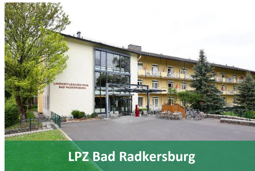
LPZ Bad Radkersburg